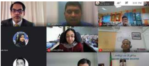
Dr Ibrahim Hassan, Minister of Higher Education, Government of Maldives enthusiastically supported e-ITEC trainings in Maldives along with Mr. Sunjay Sudhir, High Commissioner of India to Maldives and other dignitaries.