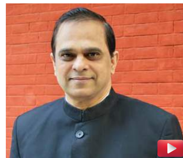
SHRI V. SRINIVAS, I.A.S. DIRECTOR GENERAL, NCGG

The National Centre for Good Governance is deeply privileged to be chosen as the institute in focus for implementing the ITEC Programs for December 2020. In July-September 2020 period, the NCGG has conducted two ITEC-NCGG workshops on "Good Governance Practices in a Pandemic" for 19 countries of Asia and 26 countries of Africa where the best practices in a pandemic – digital governance, healthcare, education, Vande Bharat Misson and redressal of public grievances were deliberated by eminent Indian and International civil servants. Over 450 delegates participated in deliberations.